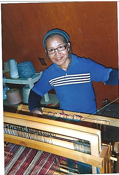
WRAP weavers demonstrating back strap weaving

http://www.worcesterrefugeeassistanceproject.org/index.html